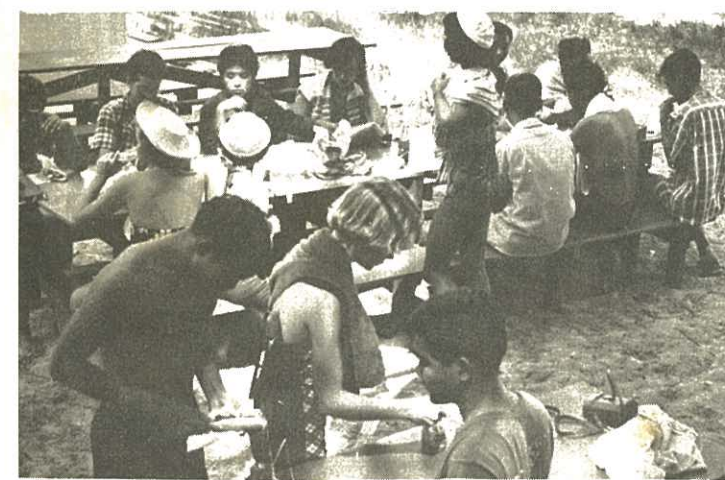
The Juniors only seem to be interested in their lunches at their picnic at Kalama Beach.

A social with a Hi-Y Club is being planned. The tentative date for this social is set for November 24 at the YWCA from 3:30-11:30 p.m.