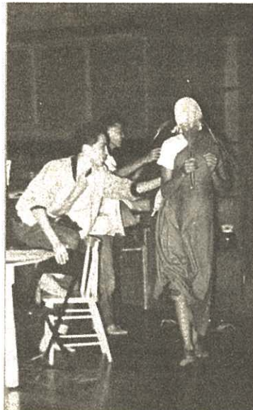
Now, now, no teasing!