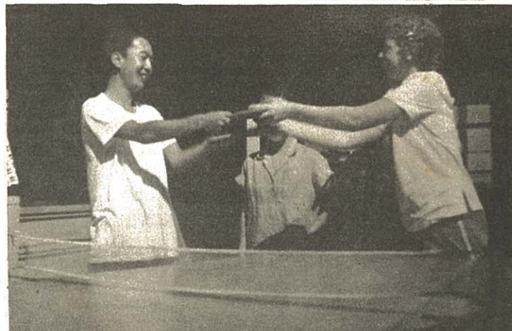
Lets trade paddles for table tennis. Don't fight now!