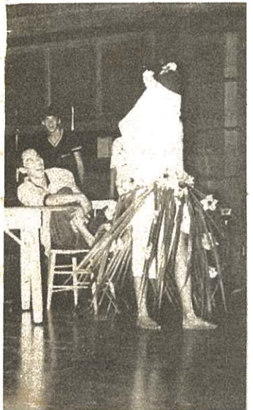
Hold your horses, boys and don't laugh so hard.

Going by this theory the Kau Kau at the Senior camp at Hale Kipa was "Number 1". First of all, for 50¢ a meal, we sure had our fill, (and a good one too.) Spaghetti, pancakes, barbecue, corn chowder, sandwiches, a picnic supper, and others. These dishes were seasoned expertly. Of course, there was a lot of chatter in the mess hall as, "Is this enough salt?" "Isn't this too thick?" or "Boil it for a few minutes!" Despite this, you'd still think the teachers and Senior's themselves were graduates of the Royal Hawaiian Hotel cooking school. The chow sure filled our tummys. Maybe, that's the reason why many a Sr. sprawled out on the comfortable cotton chair, and took a nap after meals.